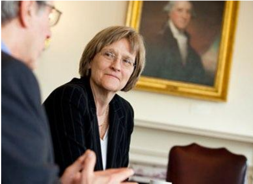
DREW G. FAUST HARVARD UNIVERSITY PRESIDENT

Hello, and welcome to Harvard. People make a university great, so whether you are a prospective student, current student, professor, researcher, staff member, graduate, parent, neighbor, or visitor, your interest and enthusiasm are valued and appreciated.